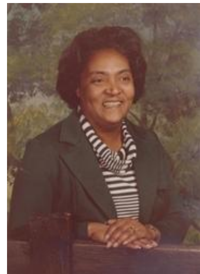
Born: July 10th, 1936 Died: November 4th, 2011